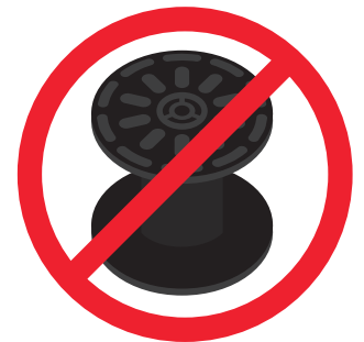
I-Orientation Avoid standing rolls on end